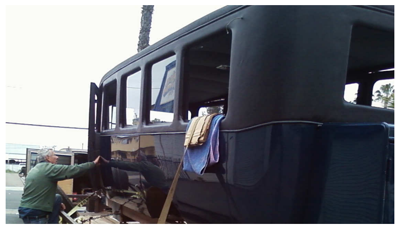
Carl Calvert admires the paint job on the 1924 Cadillac stage body after its return from the upholstery shop.

The restoration of the 1924 Cadillac stage for the Julian Historical Society has been progressing slowly but the end is in sight. The body has been returned from a stay of several months at the El Cajon Trim upholstery shop where the blue leather seats, interior and exterior upholstery was completed. It looks like a real beauty now with its shiny new paint that reflects the sun like a mirror.